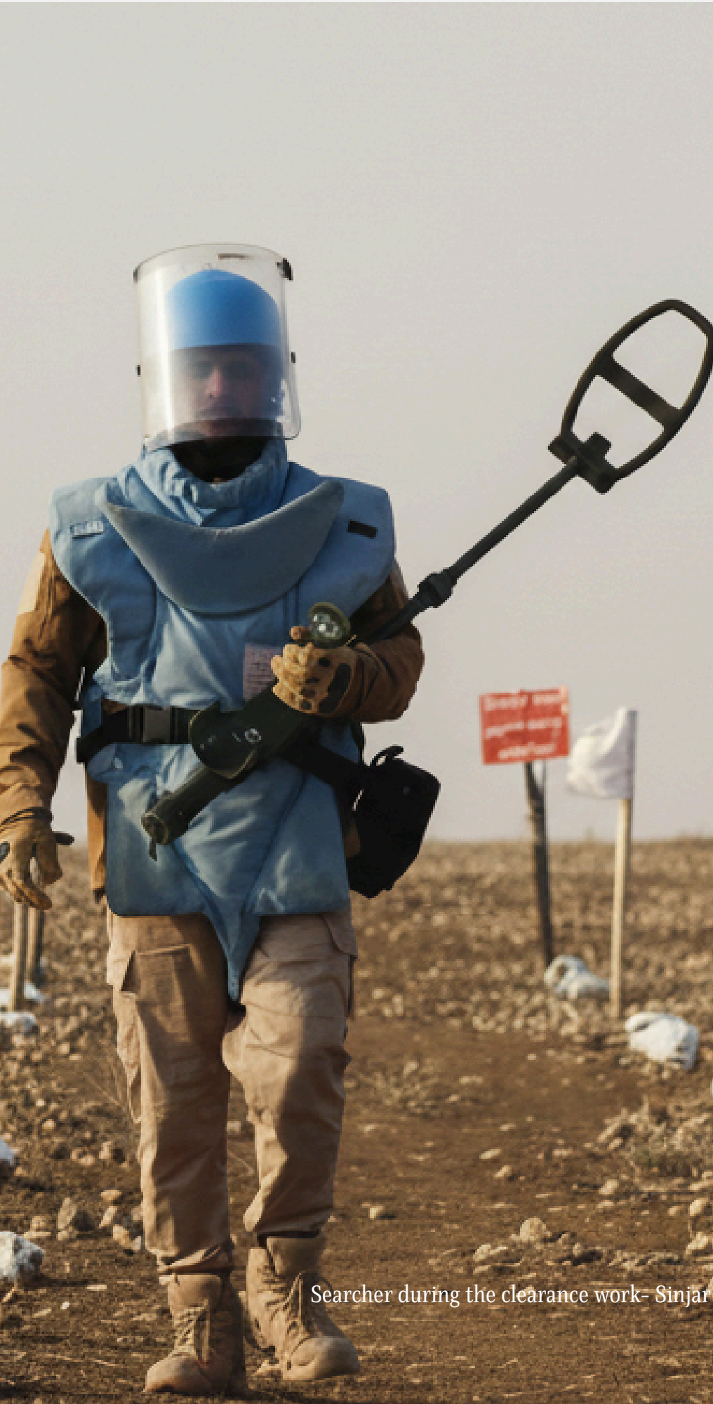
Searcher during the clearance work- Sinjar